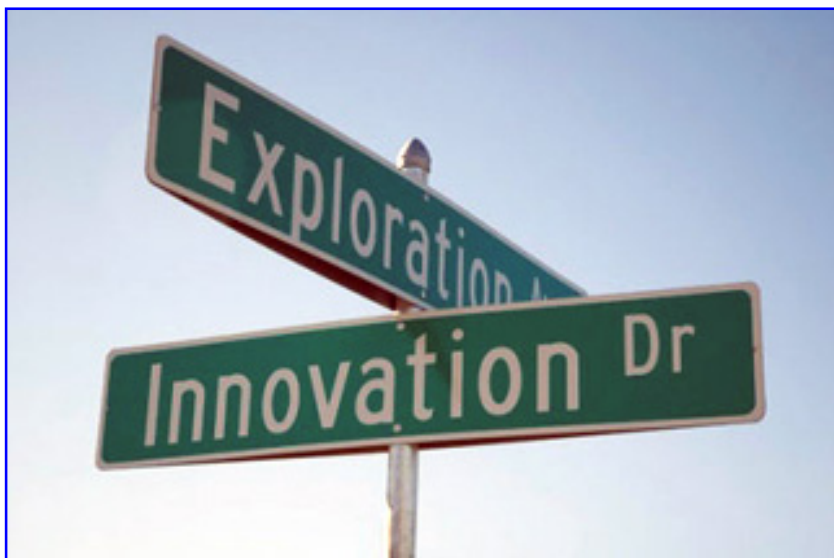
Photo taken in a Lakeland, FL business park.

MIT has always been associated with major scientific and technological breakthroughs. But the breakthroughs alone do